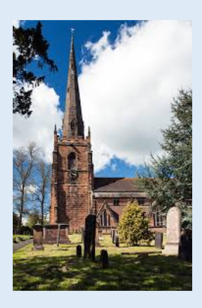
St. Mary & St. Chad Church, Brewood